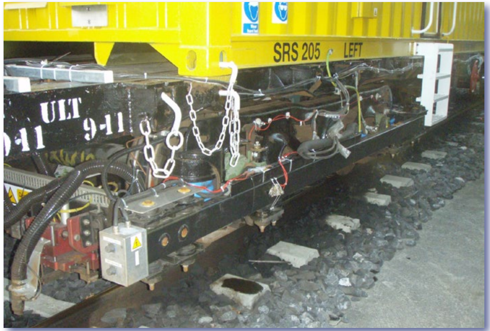
(Above) A close up of the No.1 end bogie showing some of the instrumentation fitted. There are accelerometers, displacement transducers and an inclinometer (for measuring tilt angle). A Doppler radar speed probe is fitted underneath.