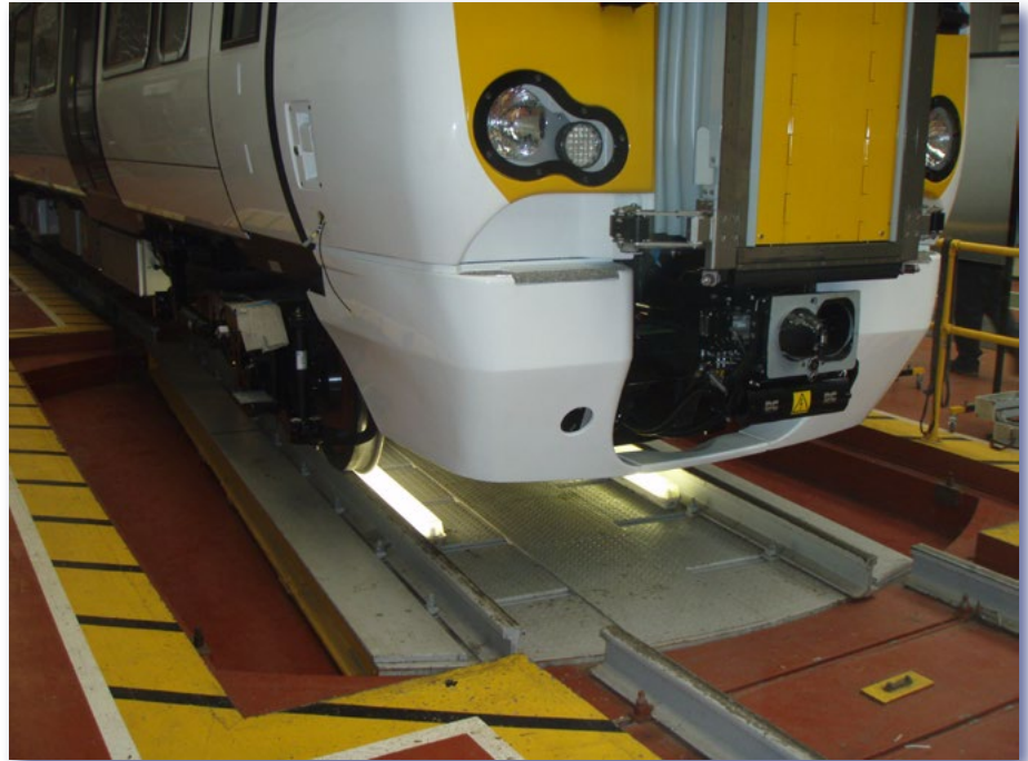
The Bombardier Derby Test Facility Bogie Rotation rig. A new UK passenger train undergoing a bogie rotation test, allowing the design engineers to validate the resistance to rotation between the bogie and carbody.

Bombardier Transportation now uses nCode GlyphWorks test data analysis software to automate this process, reducing the time required to analyze test data from 160 hours to about 20 hours. In addition to saving time, the automated process provides a very high level of assurance that the data analysis procedures required to validate compliance with the standard have been followed to specification. "We have substantially reduced the time required to analyze data not only for this customer but for all future customers that require validation to the BS EN 14363 standard," said Wendy Smith, Test Engineer for Bombardier Transportation.