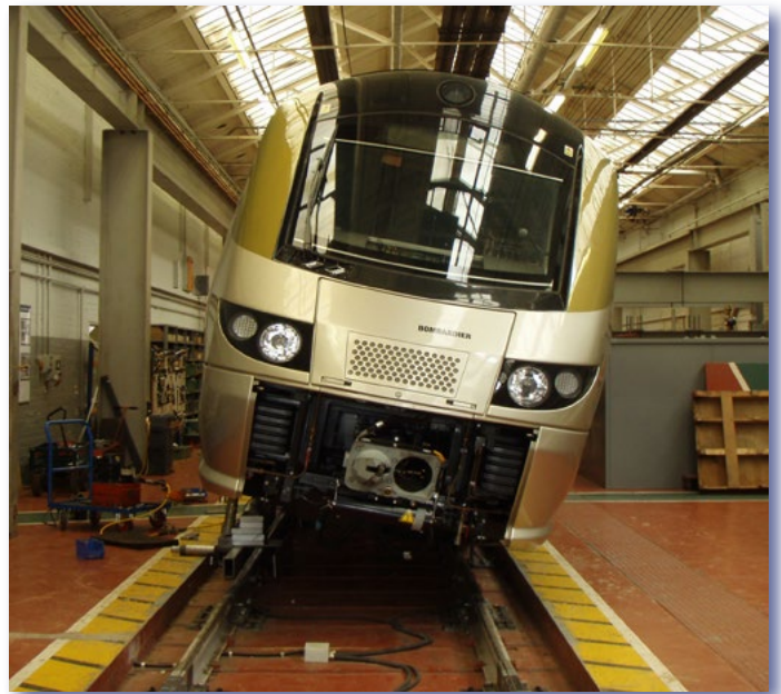
The Bombardier Derby Test Facility undertaking a vehicle sway test on an Electrostar® train. The sway test validates computer model calculations for dynamic vehicle movements on curved track.