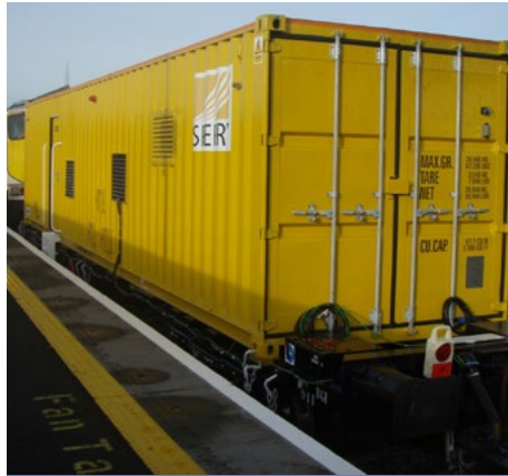
(Left) Freight wagon from Irish Rail under test, at Dromod Station in the Republic of Ireland, during ride tests.

"The easy-to-use scripting tools in GlyphWorks make it practical to automate nearly any test data analysis flow"